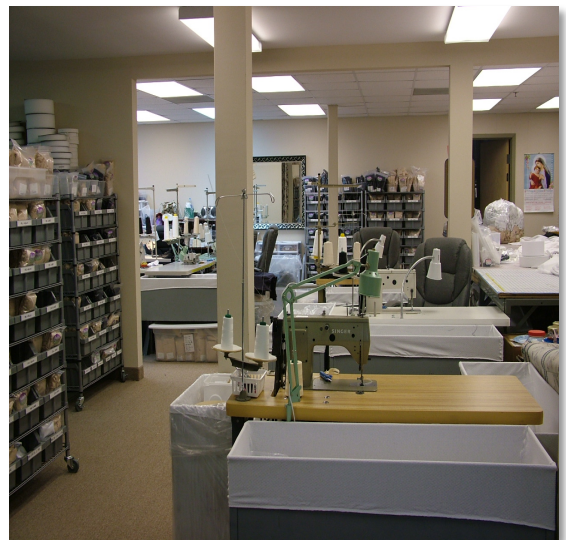
Nouvelle designs and handcrafts each compression garment from its state-of-the-art facility in Virginia Beach, Va.

A. Compression garments are specially-designed elastic apparel worn after surgical procedures and throughout recovery. They provide additional support by contouring to the body or body part. Plastic surgeons generally recommend use of compression garments following tummy tucks (abdominoplasty), liposuction, arm lifts (brachioplasty), face lifts (rhytidectomy), facial procedures, gastric bypass procedures, male mastopexy (gynecomastia treatment), breast augmentation, breast reduction, and many other types of surgical sculpture procedures. Dermatologists also may recommend compression wear for patients with lymphoma, burns, and varicose veins to help improve quality of life.